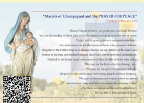
Prayer for adults