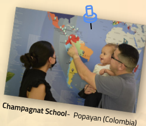
Champagnat School- Popayan (Colombia)