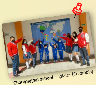
Champagnat school - Ipiales (Colombia)