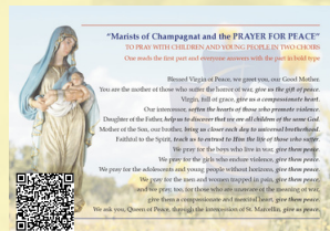
Prayer for children and young people

All Marists, everywhere in the world, pray for the end of all wars and for all the people who suffer their consequences