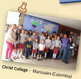
Christ College - Manizales (Colombia)