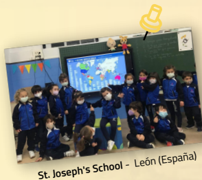
St. Joseph's School - León (España)