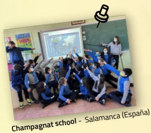
Champagnat school - Salamanca (España)