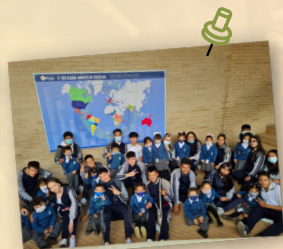
Bicentennial School - Bogotá (Colombia)