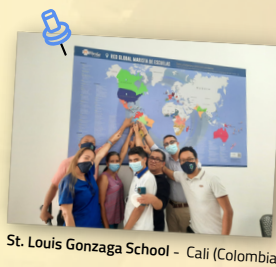
St. Louis Gonzaga School - Cali (Colombia)